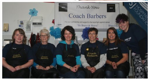
The wonderful ladies from Coach Barbers will be taking care of the shaving again this year.

Proceeds from the tournament, held February 11th, have been directed towards the purchase of a Vein Viewer. Using infrared light, a Vein Viewer projects an image of the patient's veins onto their skin so that lab assistants can easily insert needles to take blood, or insert an IV. It's able to map out veins up to 1 cm deep, determine vein diameter, orientation, valve locations, and spot rolling veins and hematomas.